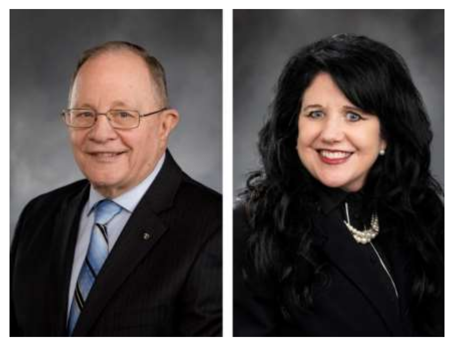
Sen. Mike Padden, ranking member on the Senate Law and Justice Committee Rep. Gina Mosbrucker, ranking member on the House Public Safety Committee